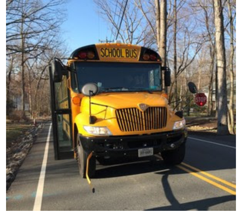
School Bus with Extended Safety Arm