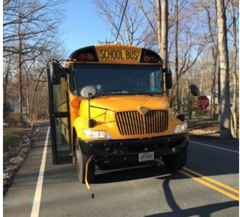
School Bus with Extended Safety Arm